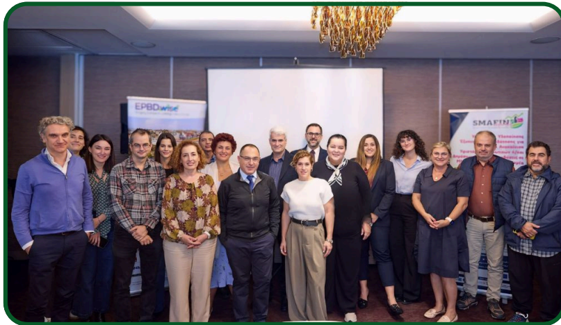
Picture: Policy forum in Greece